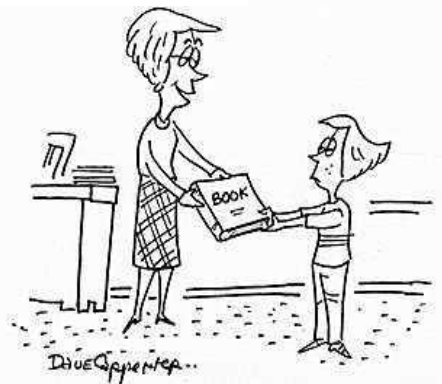
"JUST THINK OF IT AS IF YOU'RE READING A LONG TEXT- MESSAGE."